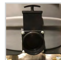
Quick-Drop Drain Valves - 1.5" (V29) and 3" (V55)