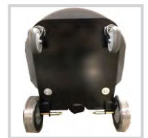
Wheels, Casters & Molded Tank are Mounted on Strong Steel Frame