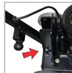
Pull the Pin for Easy Handle Removal