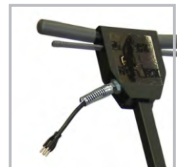
2-Piece 50 ft. Power Cord with Molded Plug