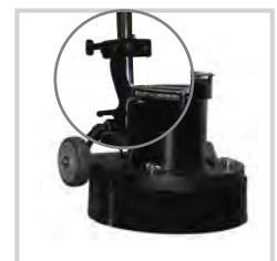
Variable Handle Height Adjustment and Transport Lock