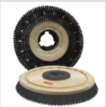
Poly Scrub Brush For general scrubbing #A0002- 17" #A0003 - 20"