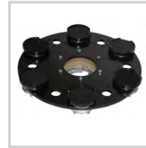
Orbitec Diamond Driver (6) Cups Hold 3" Diamond Tools, Aluminum Clutch Plate #HP0017-3 - 17"