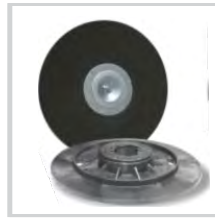
Economy Sandpaper Driver Molded Plastic Block, Cushion Pad, 1" Riser #A0014 - 17"