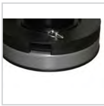
Brute 360 Weights (2) 25# Optional Weights with Locking Pins #A360-17 -17"