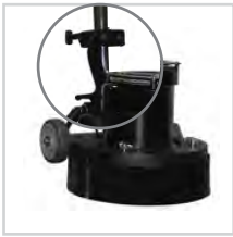
Transport Lock Kit with Variable Handle Height Adjustment #HP0005