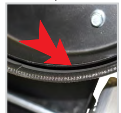
360° Duct in the Brush Apron Directs Debris to the 2" Vacuum Port