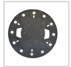
Claw Diamond Disc Driver #CLAW17 - 17"