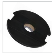
Weighted Diamond Pad Driver Steel Block & Aluminum Clutch Plate #A0010WTDPD - 17" (46#)