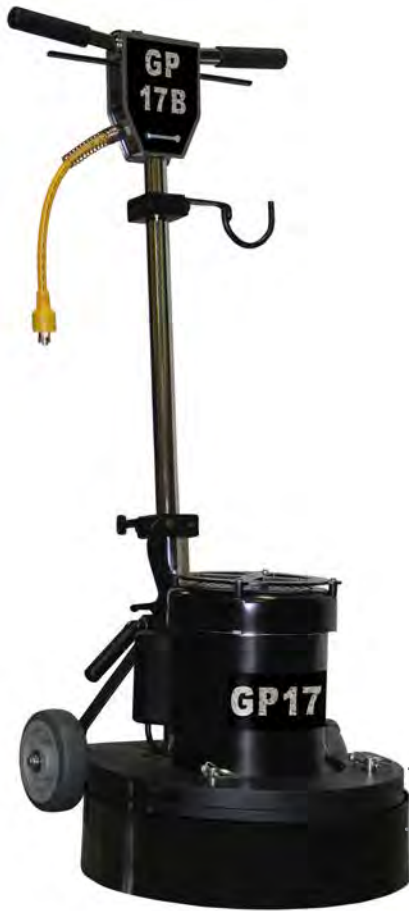
Shown with an Optional Weight Set