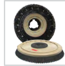
Black 80 Grit Brush Strip/scrub with stiff black 80 Grit bristles #A0008 - 17"