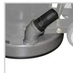
The Steel Brush Cover is Built with a 1.5" or 2" Vacuum Port