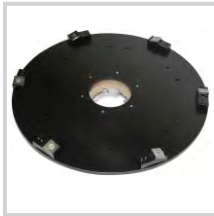
HAWK Surface Prep Scraper With replaceable carbide blades #HP0033 - 17"