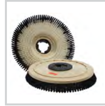
Nylon Carpet Brush Scrub with soft & stiff nylon bristle mix #A0006-17" #A0007- 20"