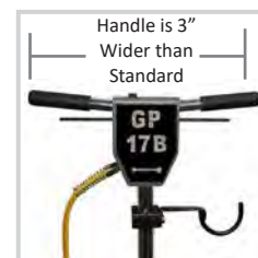
The Handle-Mounted Hose Support Carries 1.5" and 2" Vacuum Hoses