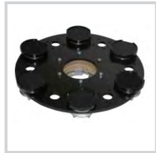
Orbitec Diamond Driver (6) Cups Hold 3" Diamond Tools, Aluminum Clutch Plate #HP0013