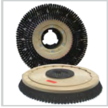
Poly Scrub Brush For General Scrubbing. Np9200 Clutch Plate & Riser. #A0020-DUAL - 13"