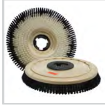
Nylon Scrub Brush For General Scrubbing. NP9200 Clutch Plate & Riser. #A0016-DUAL - 13"