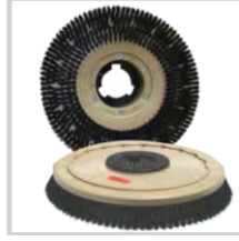
Grit Scrub Brush For Aggressive Scrubbing with 80 Grit Bristle. NP9200 Clutch Plate & Riser. #A0018-DUAL - 13"