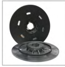
Premium Pad Driver Harpoon Style Face with NP9200 Clutch, Plate and 3/4" riser #A0017-DUAL - 13"