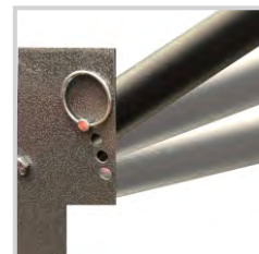
Pin-Lock Handle Adjusts from 32" to 40" High