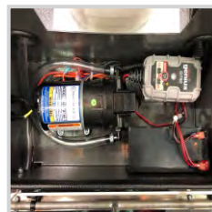
Battery Powered Pump Moves Finishes from Pail to Floor